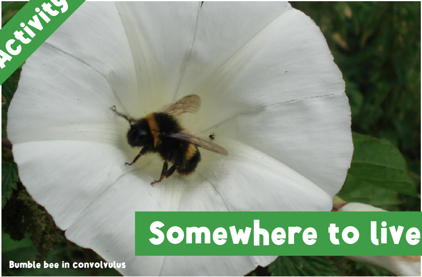
Bumble bee in convolvulus

All animals have a place where they like to live. Some build nests or dens, but many don't. They all need the right sort of things in the area where they live. People need a home, with shops, schools and roads nearby. What do the animals on the reserve need? Choose an animal that lives on the Reserve. It can be a bird, a mammal, a fish, an insect - any animal that you know is living on the reserve. If you can, watch the animal and see what features of the reserve it is using: trees, the water, flowers. Do some research to find out more about this animals life.