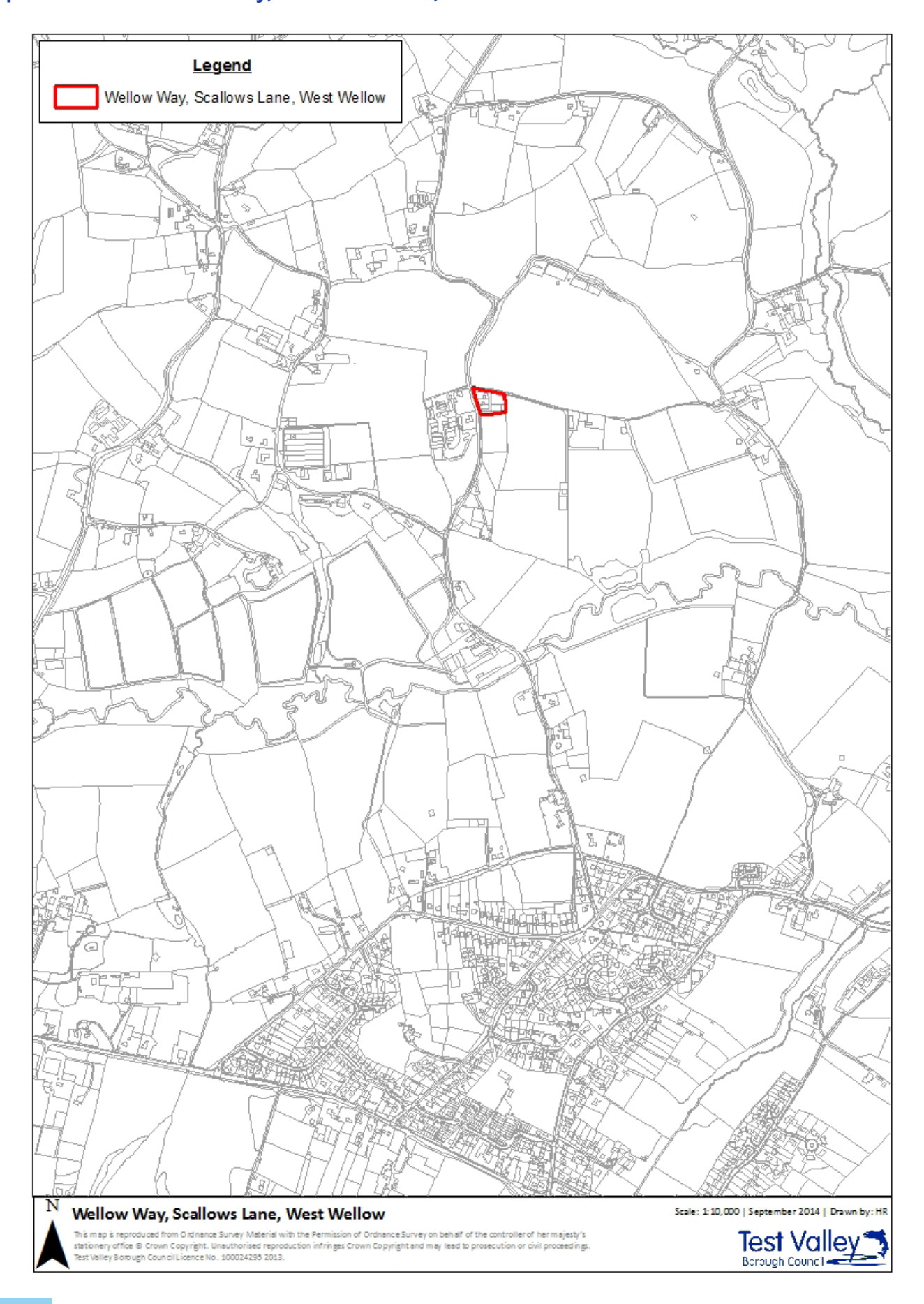
Map A: Land at Wellow Way, Scallows Lane, West Wellow