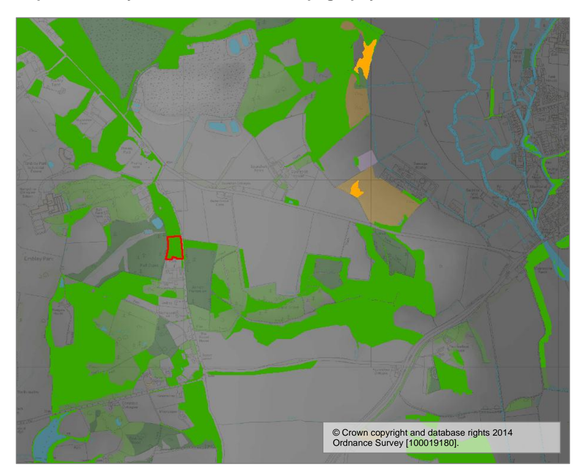
Map 5.2 - Policy TSP01 - habitat and topography context