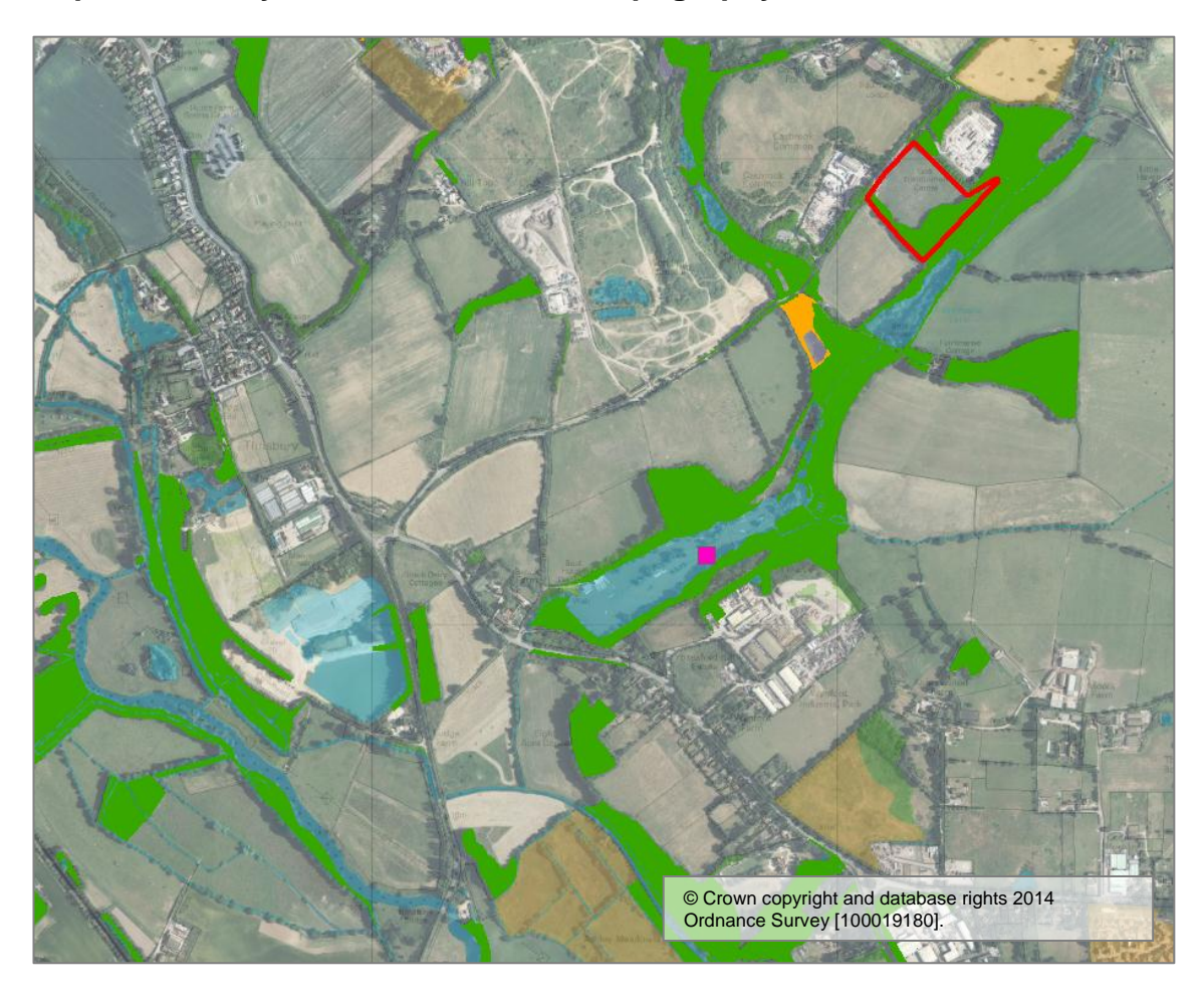
Map 5.2 - Policy TSP01 - habitat and topography context

5.16 This site is set within a mosaic of habitats that are of importance to barbastelle bats. Map 5.1 shows the site (red outline) in the wider context, with the key habitat types favoured by barbastelle bats highlighted.