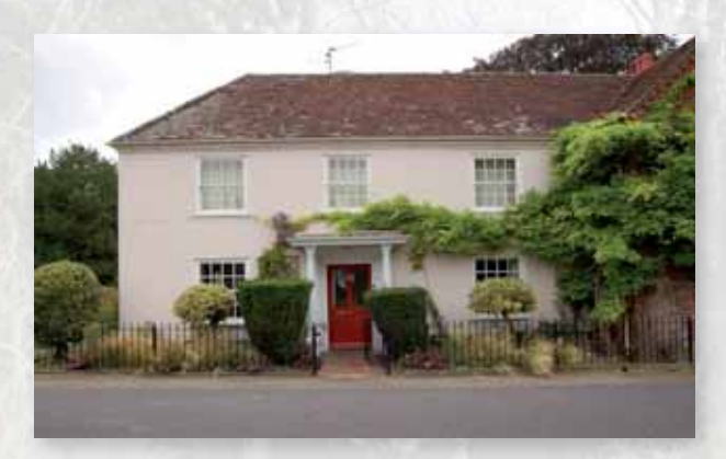
The Malt House

turret which is incorporated within one of the massive diagonal buttresses. The churchyard is surrounded by an early 19th century brick and flint boundary wall and at the south east corner, adjacent to the road junction, mounted on the wall is a fragment of a medieval cross said to be from Llanthony Abbey in Gloucestershire. In the churchyard are nine early 19th century Grade II listed stone table tombs – each being rectangular in shape with various carved decorations.