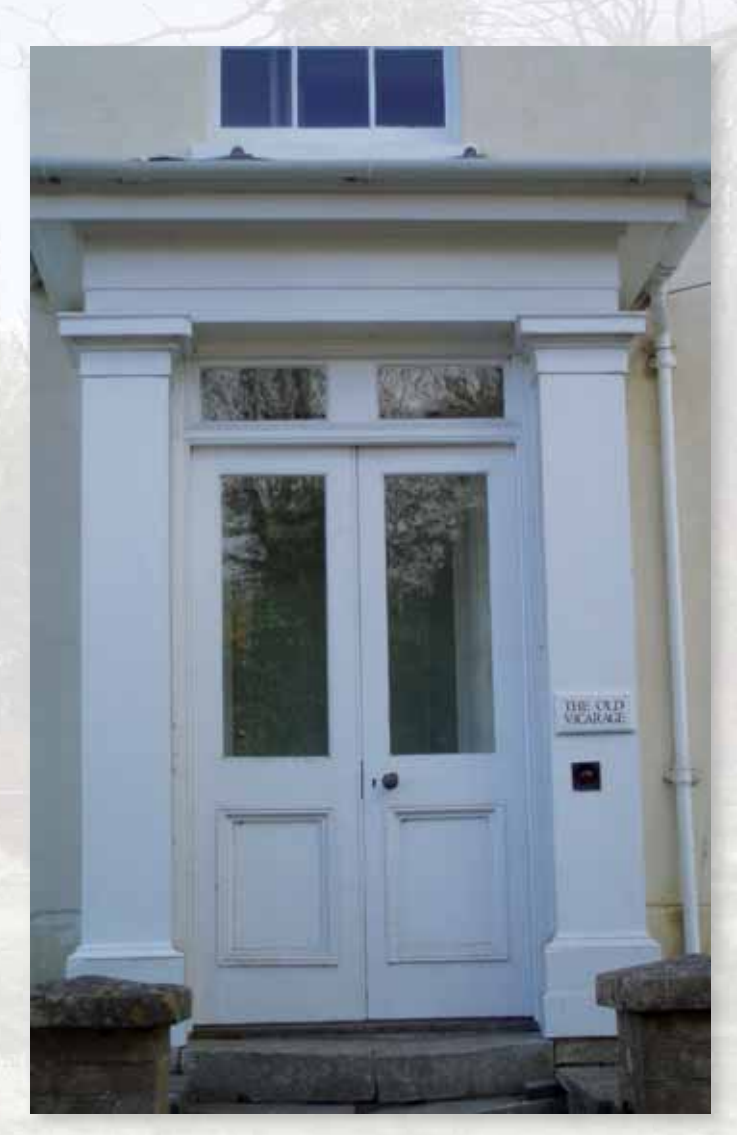
The Old Vicarage porch

Notwithstanding this, development on the edge or immediately outside the conservation area boundary could have a detrimental impact on views into and out of the conservation area, which national government guidance on the preservation and enhancement of conservation areas seeks to resist.