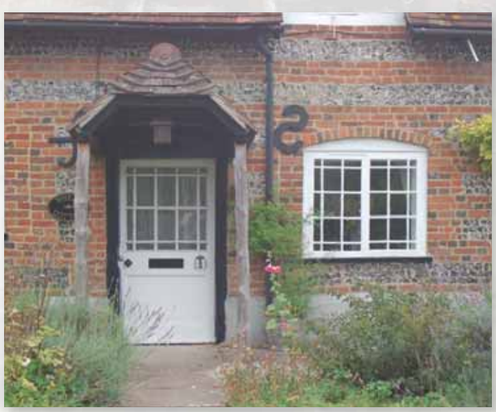
diagonal leading or wood casements with small pane glazing.

Wheat Cottage by contrast is a simpler building dating from the early 17th century with later alterations. It is constructed of various materials and includes a timber frame with panels of plastered wattle and daub and red brick and knapped flint. The windows are metal casements with