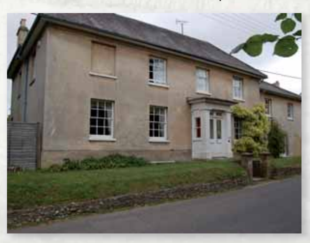
The Old Vicarage

Of the listed buildings, The Old Vicarage and The Plough are notable for the high quality architectural design and detailing. The Old Vicarage dates from the 18th century and has a 19th century stucco exterior (render lined out to look like stonework) with a hipped slate roof. It has 12 pane timber sliding sash windows and a decorative porch and doorcase. Within its grounds, to the rear, appears to