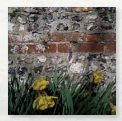
Church flint and brick wall

Garden walls, traditionally detailed fences and other means of enclosure such as hedges (discussed later) are important components and have a significant contribution to the character of the village. Many historic boundaries remain, defining the original plot sizes and are natural or man made.