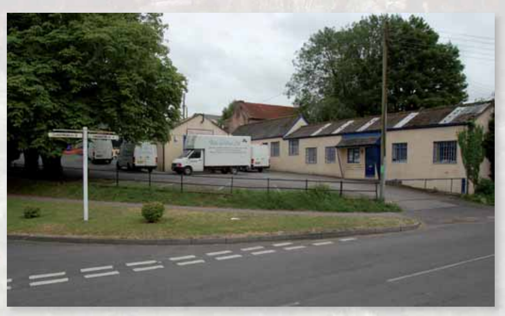
Factory yard as seen from the Church

One of the most intrusive features within the conservation area is the prevalence of overhead wires, which are particularly dominant within the historic streetscene. The commercial yard area next to the Old School House and adjacent to the Church also detracts visually from the quality of the centre of the conservation area, due to the nature and scale of the modern commercial buildings on site and open storage of materials. Enhancement of the screening of this area and modification of storage regimes and building maintenance would help to enhance this part of the conservation area and to safeguard any further erosion of the setting of the Old School House and Old School Room.