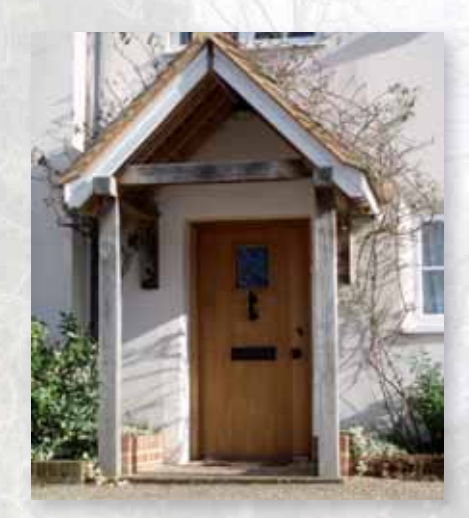
Chalk Dell porch

The majority of windows in Barton Stacey are of a reasonable standard of design. Fortunately, the use of non-traditional materials, such as PVCu, has so far been largely avoided. While aspirations to improve thermal insulation are understood, wholesale replacement of well-designed traditional windows can rarely be achieved satisfactorily using sealed double glazed units. A more appropriate solution is likely to be through proprietary draught stripping and secondary glazing. Existing windows should be retained, repaired or remade to a design appropriate to the period and design of the property.