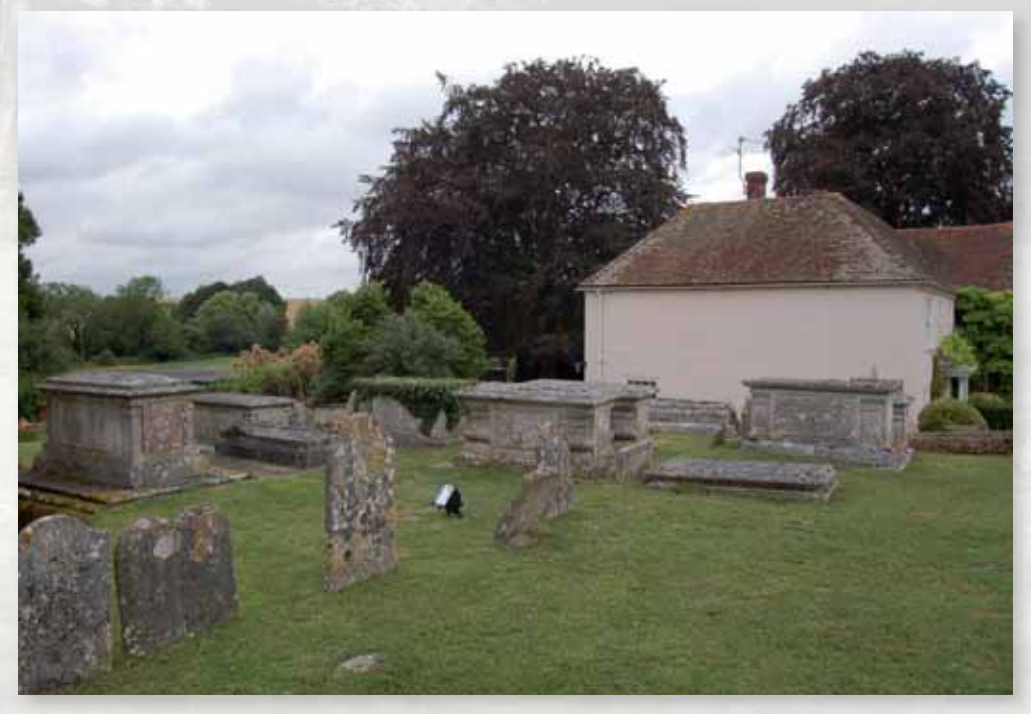
Group of chest tombs within churchyard