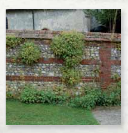
Detail of brick and flint churchyard wall