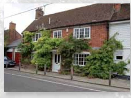
The Old Plough

western side of plots, generally following the random frontage building line of the more historic development with individual vehicular accesses. However the area of development called 'Ashfields' located around the southern end of this character area consists of a number of houses grouped around a common shared access, which is alien in character to the linear historic development which is a characteristic feature of the settlement.