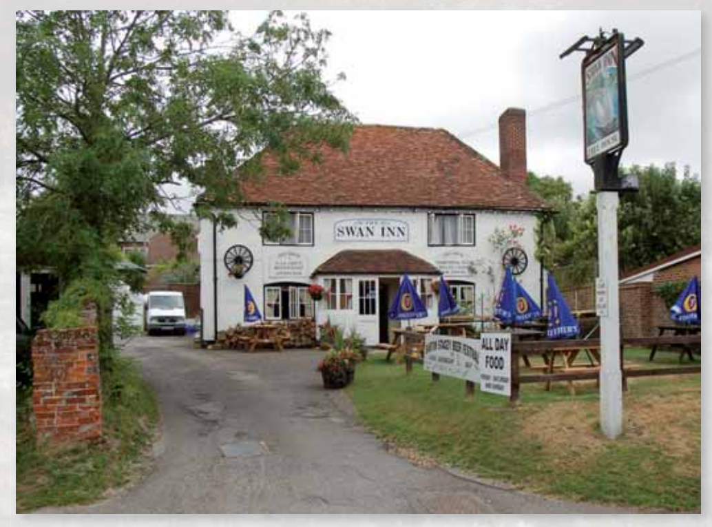
The Swan Inn