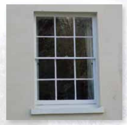
The Old Vicarage sash window

The majority of windows in Barton Stacey are of a reasonable standard of design. Fortunately, the use of non-traditional materials, such as PVCu, has so far been largely avoided. While aspirations to improve thermal insulation are understood, wholesale replacement of well-designed traditional windows can rarely be achieved satisfactorily using sealed double glazed units. A more appropriate solution is likely to be through proprietary draught stripping and secondary glazing. Existing windows should be retained, repaired or remade to a design appropriate to the period and design of the property.