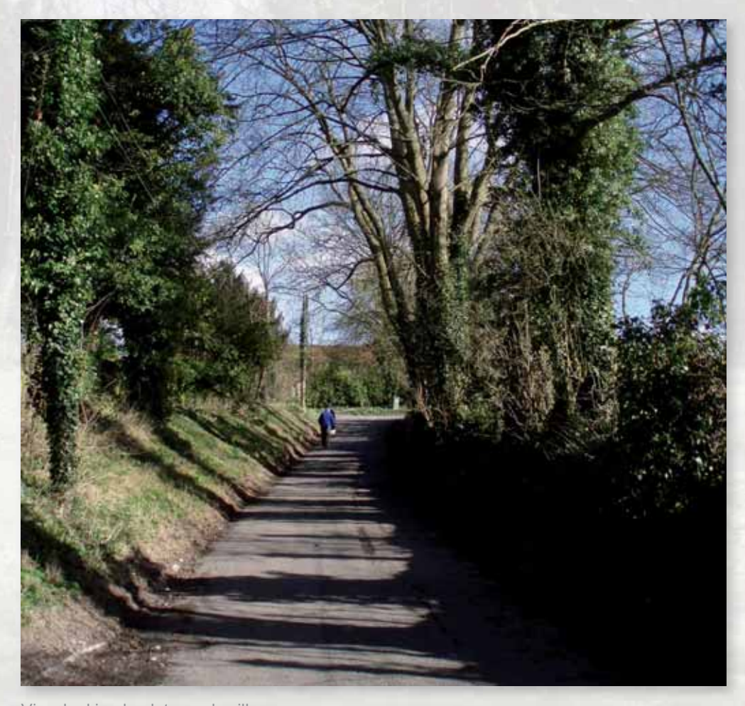
View looking back towards village