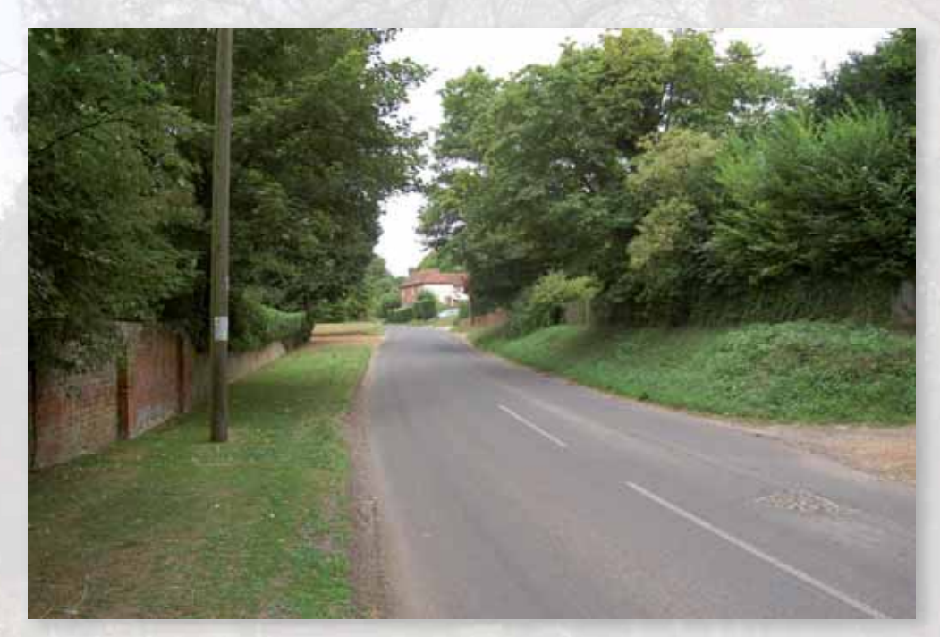
View into the village towards Wades Farm