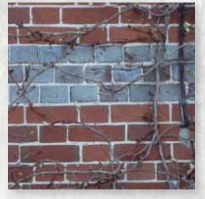
The Old Plough brickwork detail

Before carrying out repairs or considering extending or altering historic buildings within the village, whether listed or not, the original method of construction should be studied, understood and followed to preserve the historic fabric and character of these important buildings.