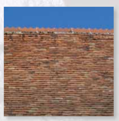
Church roof detail

Clay tiles (mainly handmade) are commonly used in the village, with natural slate used from the 19th century onwards. There is also some later use of concrete tiles. Unfortunately, this material has a much heavier profile than clay tiles and can often appear unduly prominent; therefore, its use is discouraged within the conservation area.