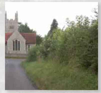
Church framed by trees

village from the north and west. In the south, there is a mature tree boundary to Barton Cottage, forming a natural end-stop to the village area and a copse of trees in the Wades Farm area. Mature trees do feature quite prominently at the western end of the churchyard and descend to the valley bottom. Surprisingly, several important tree specimens with significant prominence within the village also exist within the commercial area to the east of the staggered crossroads.