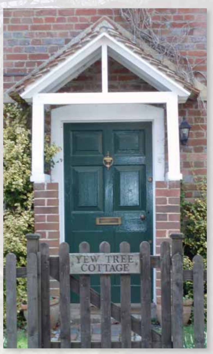
Yew Tree Cottage porch