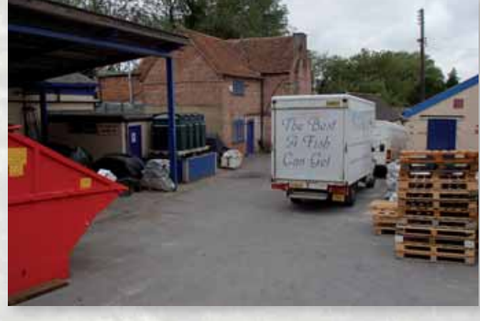
Old School House building in factory yard

building as the road gently slopes down to the staggered crossroads. Views are also allowed across the important open space to the north of Bullington Lane, as well as across the open countryside to the northeast. These views help to reinforce the important historic character of this rural conservation area with the traditional prominent and significant church building at its heart.