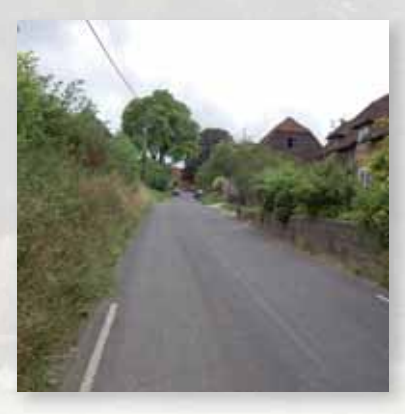
View looking south into conservation area

The most important views looking into, out of and through the conservation area are shown on the Character Appraisal map. These contribute to the character and setting of the conservation area and care needs to be taken to ensure that these are not lost or compromised by inappropriate development or poorly sited services.