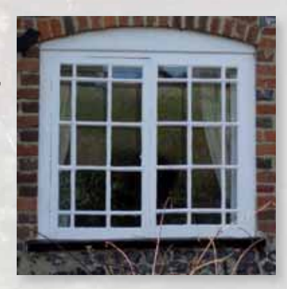
Wheat Cottage casement window

There are a number of traditional styles of window within the conservation area, including timber windows with traditionally glazed leaded lights formed of individual 'quarries' of glass (individual diamond or square pieces of glass) with lead 'cames' (the lead which connects the individual pieces of glass together); and cast iron framed and small paned windows, (such as Wheat Cottage), often with decorative window 'furniture', i.e. catches and window stays. One of the styles found in the conservation area is commonly termed the 'Hampshire casement'. This is a well proportioned single glazed timber window with a single horizontal glazing bar equally dividing the panes.