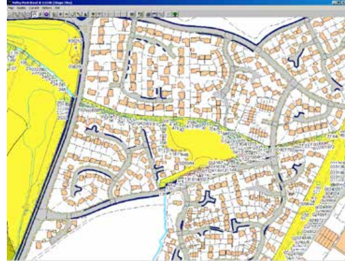
Tree survey extract from Ezytreev tree management database software