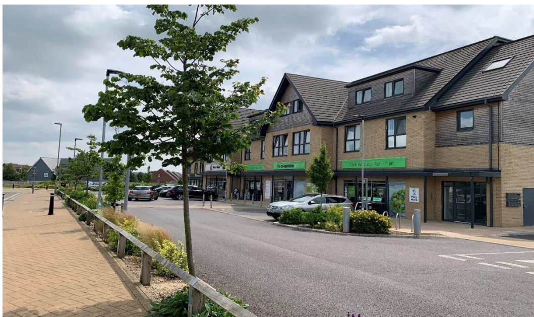
Image 1: Commercial facilities within the Local Centre in East Anton, Andover