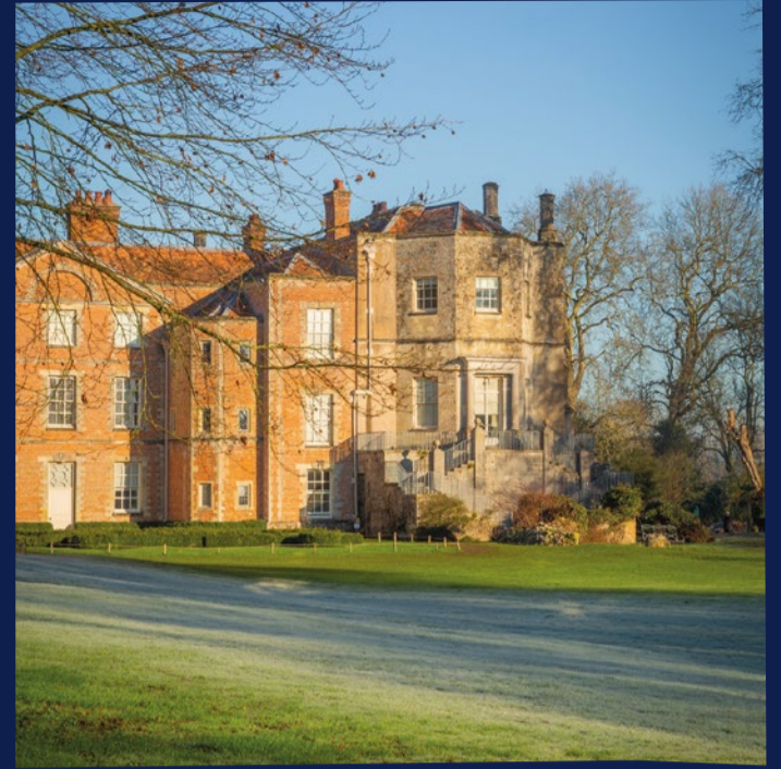
© National Trust 2022. Registered charity no. 205846.