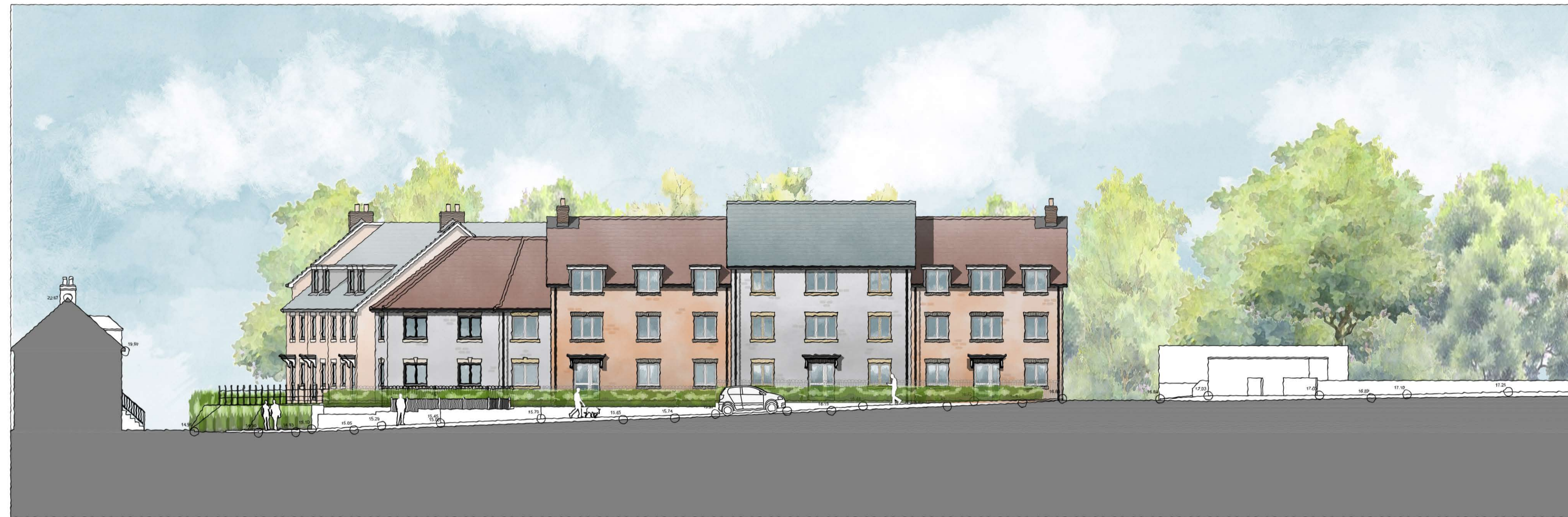
Broadwater Road Contextual Elevation