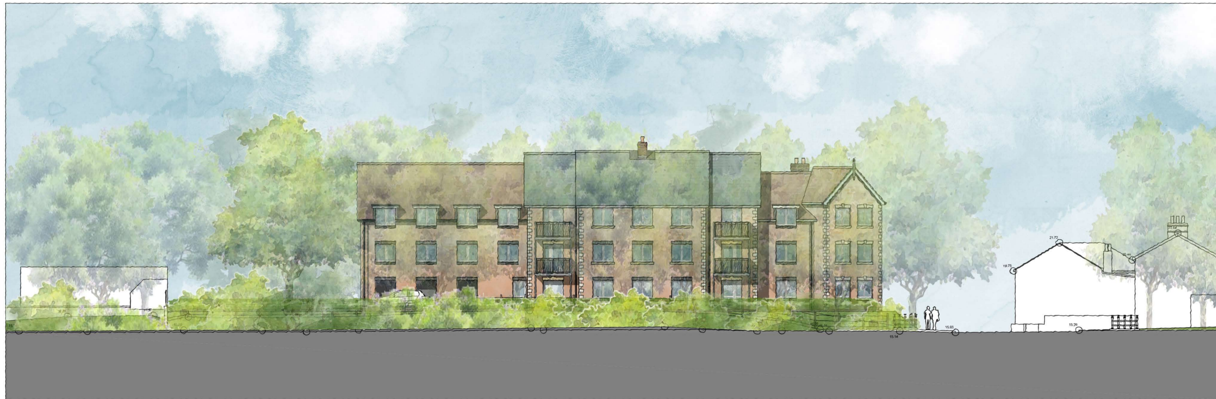
Bypass Road A27 Contextual Elevation