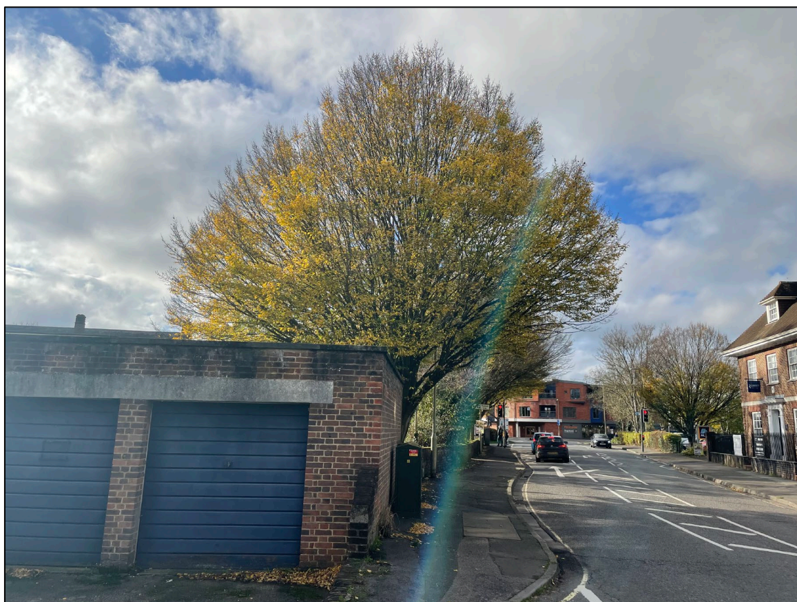
Photo 1: Showing tree T21 which grows immediately adjacent to an existing garage block. The garage block will be replaced with a new electricity substation, the design principle is to ensure the new foundation is no deeper than the existing garage foundation so that roots beneath the garage are not affected. The demolition of the garage will be carried out under arboricultural supervision.

Tree T21 grows immediately adjacent to an existing garage block. It is proposed to replace the garage block with a new electricity substation. The design principle will work on the basis that the new substation foundation will be no deeper than the existing garage foundation to reduce any impact on roots growing beneath the garage. This installation can be carried out without any significant new excavation into existing soil levels, which should allow any roots below the existing building to be left intact. In summary, if the guidance set out in SGN 9 Installing/upgrading surfacing in RPAs and SGN 10 Installing structures in RPAs , is observed, we believe that the proposed works can be implemented without any long term detrimental impact on tree health, and therefore local character.