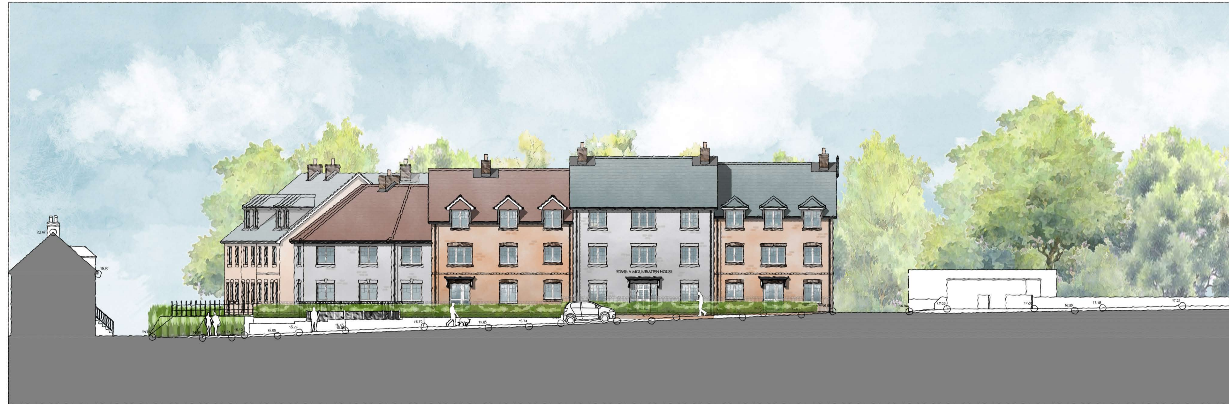
Broadwater Road Contextual Elevation