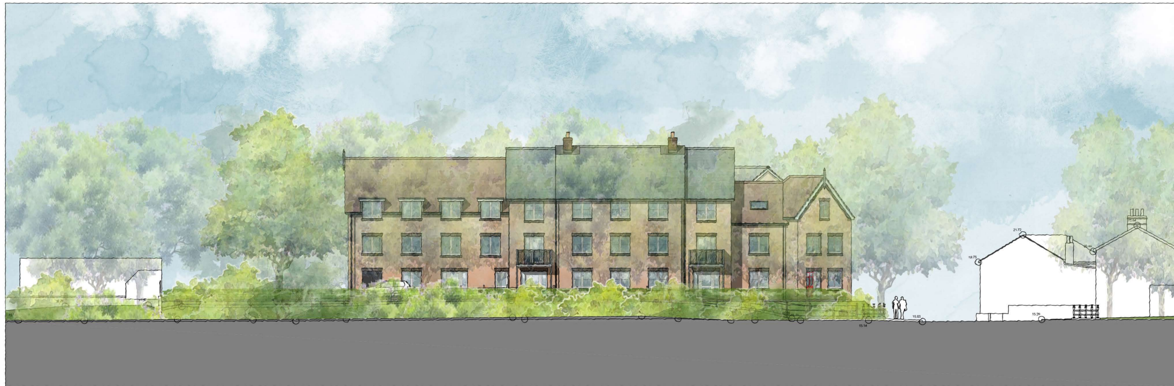
Bypass Road A27 Contextual Elevation