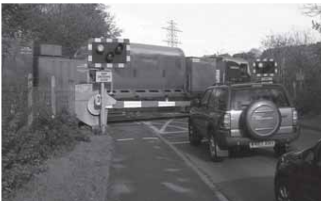
Level crossing in Halterworth Lane

Crampmoor and Highwood are small settlements on the eastern extremity of Romsey. Most of the settlement is on the slopes of the valley created by the small stream that has kept its Saxon name of Tadburn Lake. It rises in nearby woods and marshy land and is a tributary of the River Test. In addition a few houses have been built on the plateaux on either side of the valley.