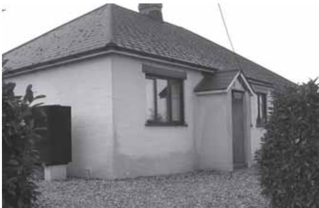
Bungalow in Highwood Lane

In the inter-war period, a number of bungalows were built. These reflect both the prevailing fashion and the unsuitability of the ground for anything taller. There is a row of them at New Pond and others scattered across the area. Those at New Pond are L-shaped, some with extensions to the front and others at the back.