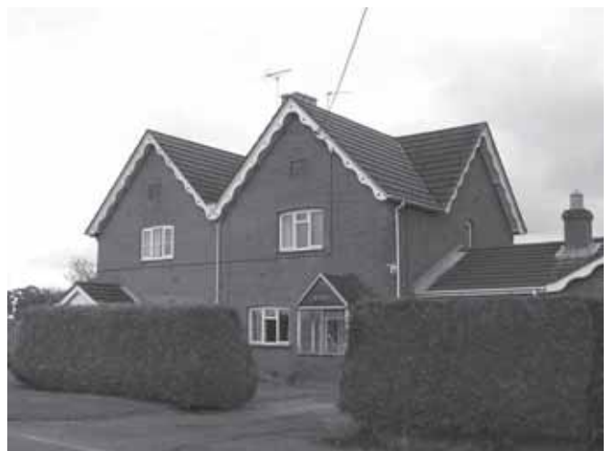
Estate cottages, Highwood Lane

During the 19th century, Highwood House, now Stroud School was built, with attendant houses for employees both within the immediate grounds and in Highwood Lane.