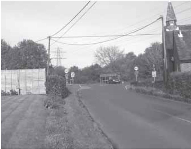
Cables and signs in Halterworth Lane

There are overhead cables in most of the area except for Straight Mile and Groveley Way. These spoil the views of individual roads. Even more obtrusive are the high voltage overhead power lines that march across the valley from Highwood to Woodley.