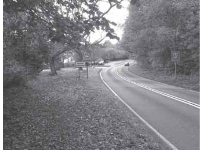
The Romsey end of the Straight Mile

As is to be expected in this diverse area, the roads are all very different. What they have in common however is their rural feel: they are very definitely country roads in appearance.