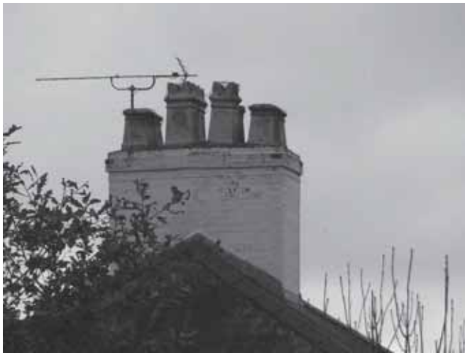
Chimneys in Crampmoor Lane

Some of the houses have gables or roof-lights let into the roof, often added after the house was built. Some properties have both.