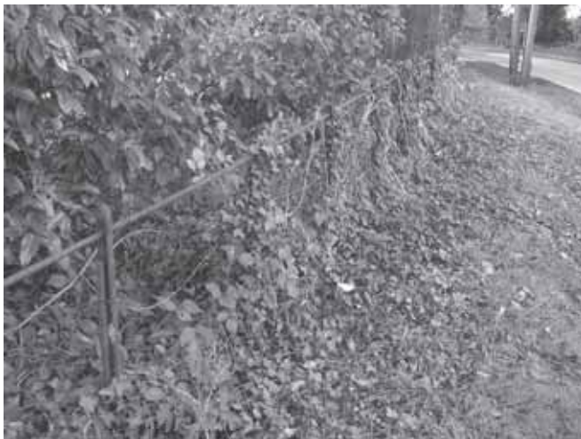
Fencing in Highwood Lane

There are one or two brick walls, and some of them are topped with hedges.