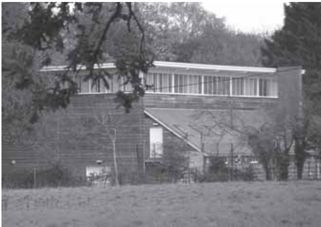
Stroud School from Highwood Lane

Like Crampmoor Lane, Highwood Lane contains a right-angle bend. There are a few houses about halfway along the north-south section, and a scattering of houses and bungalows on the east-west section. Stroud School occupies the angle between Green Lane and Highwood Lane in Highwood House and its grounds. There is a complex of buildings associated with the school, few of which can be seen from the road.