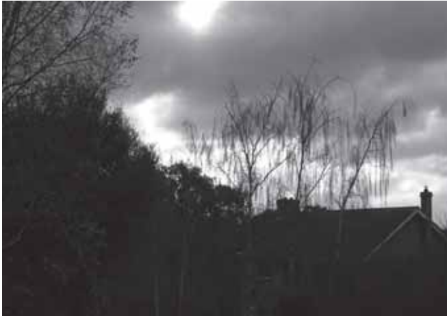
Skyline, Groveley Way

A stream runs down the side of Crampmoor Lane into Tadburn Lake. Tadburn Lake can be seen in both Crampmoor Lane where there is a ford and footbridge, and in Halterworth Lane where the road crosses it in such a way that most drivers do not appreciate that there is a bridge.