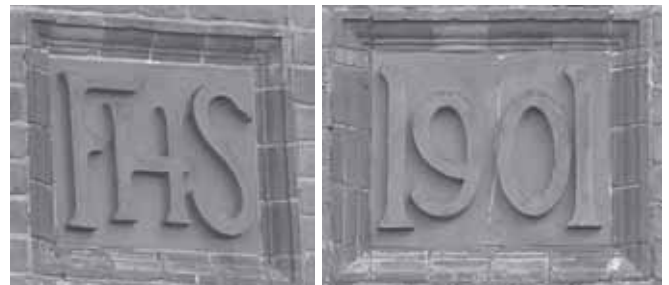
Terracotta panels in Highwood Lane

The houses are brick built with very little ornamentation. A few of the nineteenth century houses have decorative ridge tiles and finials, but these are exceptional. Apart from Highwood House and one or two houses in Highwood Lane, the houses are built of header-bond brick with no patterning. Some of the houses are painted. Highwood House, a Victorian building, is amongst the largest houses in the area. Its gabled bays include one that is in the Dutch style. Two of the former estate cottages are decorated with terra cotta panels commemorating Florence Horatia Suckling who lived at Highwood House in the years around 1900.