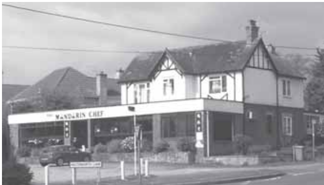
Mandarin Chef restaurant at the junction of Winchester Road and Halterworth Lane

The A3090 passes along the north of this area. There are a few houses and a restaurant at the western end, where the road rises up to the Woodley area of Romsey. St Swithun's Church is east of the junction with Halterworth Lane beyond which is the area known as New Pond, containing bungalows on the southern side. They are separated from the main carriageway by a service road and grass verge that once formed the main road. This stretch of the A3090 is called Winchester Road.