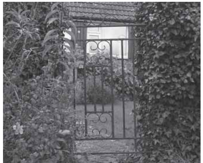
Gate in Crampmoor

The bungalows in the New Pond area are likewise much sheltered by trees especially at the eastern end while the individual bungalows have a mixture of low walls and low hedges. The houses west of Halterworth Lane have fairly high hedges.