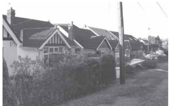
Bungalows in Winchester Road

As might be expected in an area of low density housing, there are few recognisable building lines, although where houses or bungalows were built as groups, some short lines exist.