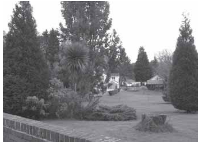
Garden in Crampmoor Lane

Crampmoor Lane opens off the A3090 and runs due east with a southern spur that takes it across Tadburn Lake and the railway. The houses and bungalows here are almost all detached and those on the north side of the lane have long gardens. A close, Groveley Way, was constructed in land on the north and contains six detached houses between Crampmoor Lane and Straight Mile.