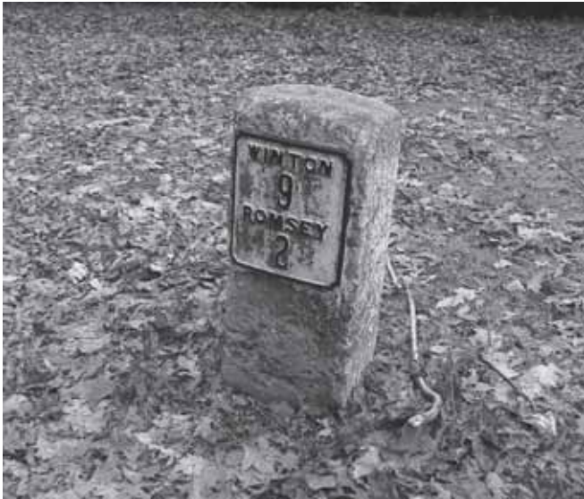
Milestone at start of Straight Mile

The only formal footways are found in or near Halterworth Lane and in the nearby stretch of Highwood Lane. There are also footways behind St Swithun's church and in either direction along Winchester Road. The surfaces of all the roads and footways are tarmac. There are no decorative features, such as paving stones or brick setts.