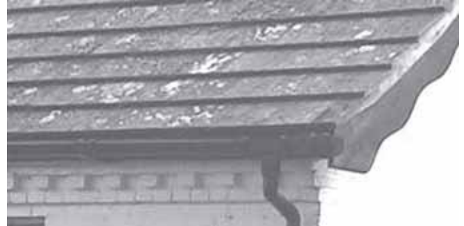
Decoration in Crampmoor Lane

The houses are brick built with very little ornamentation. A few of the nineteenth century houses have decorative ridge tiles and finials, but these are exceptional. Apart from Highwood House and one or two houses in Highwood Lane, the houses are built of header-bond brick with no patterning. Some of the houses are painted. Highwood House, a Victorian building, is amongst the largest houses in the area. Its gabled bays include one that is in the Dutch style. Two of the former estate cottages are decorated with terra cotta panels commemorating Florence Horatia Suckling who lived at Highwood House in the years around 1900.