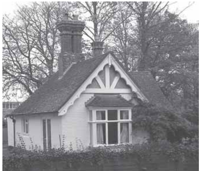
Lodge house at Highwood

The older houses have slate roofs. Some of the bungalows still have the diamond shaped asbestos-type tiles that were much used in the 1930s. A few houses have clay tiles, while the rest have modern red concrete tiles, some plain and some ridged. Some of the older houses have decorative ridge-tiles. The houses associated with Highwood House have decorative barge boards around the gables.