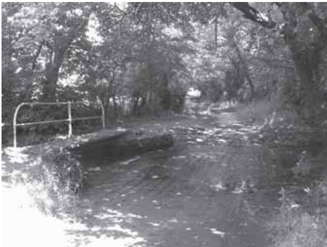
Tadburn Lake, Crampmoor Lane

Public open spaces include the verges beside the A3090 in the New Pond area, and the service roads alongside Straight Mile. The southern service road leads to a footpath in the neighbouring parish of Ampfield forming a popular walk. The stretch of Crampmoor Lane south of the railway line is now closed to traffic and is maintained by Romsey Extra Parish Council as a public footpath.