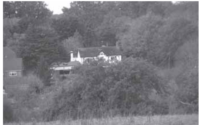
View across Tadburn valley

A railway line cuts through the area from west to east and runs close to the Tadburn Lake. The area to the north consists of Crampmoor, Straight Mile and New Pond. South of the railway line is the sparsely populated area known as Highwood.