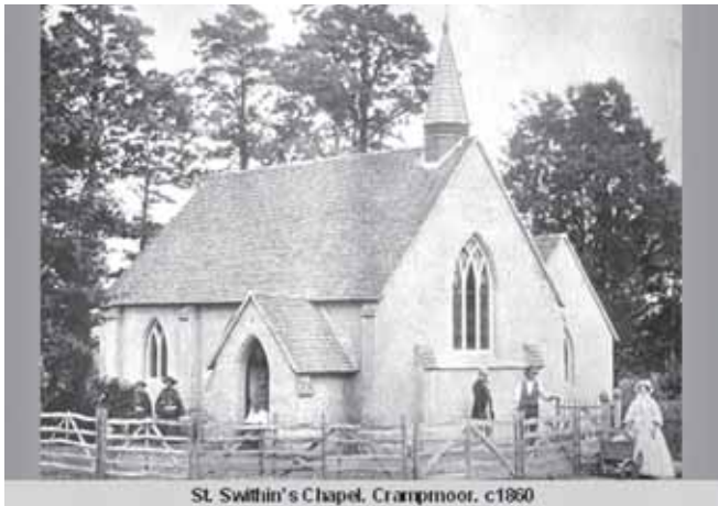
St Swithun's church c.1860

In Crampmoor Lane a few farm cottages survive from a similar era. St Swithun's Church dates from the 1850s.