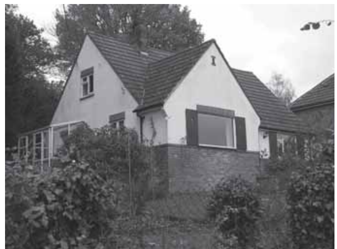
House in Crampmoor Lane

The houses in Crampmoor and Highwood are two-storey high, and both they and the bungalows, where extended, have usually been enlarged outwards rather than upwards.