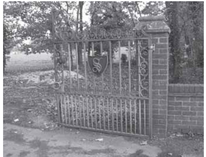
Gate to Stroud School

In addition, on the corner of Highwood Lane there is a set of railings of a style found on nineteenth century parkland. Stroud School has an ornamental gate which, with its logo, makes a pleasant entrance there.