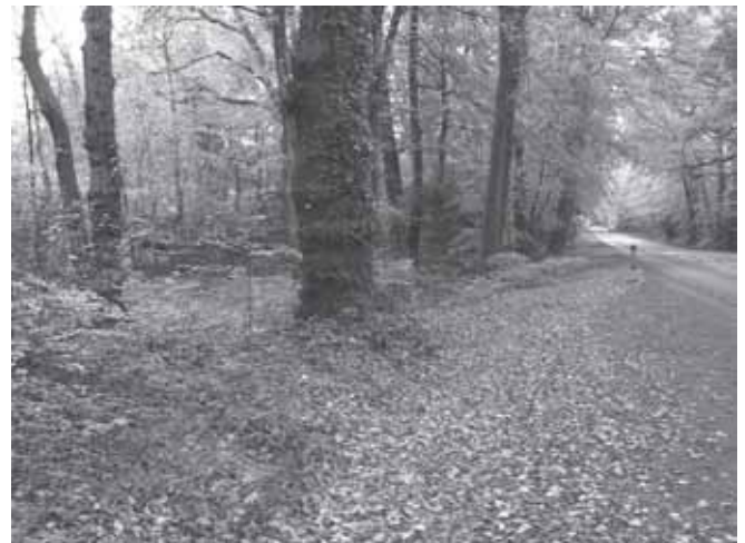
Service road alongside Straight Mile

There are woodland trees along Highwood Lane and Crampmoor Lane, including some fine mature oak trees. There is a notable stand of silver birch in Groveley Way. In addition within the large gardens there are many unusual and ornamental trees.