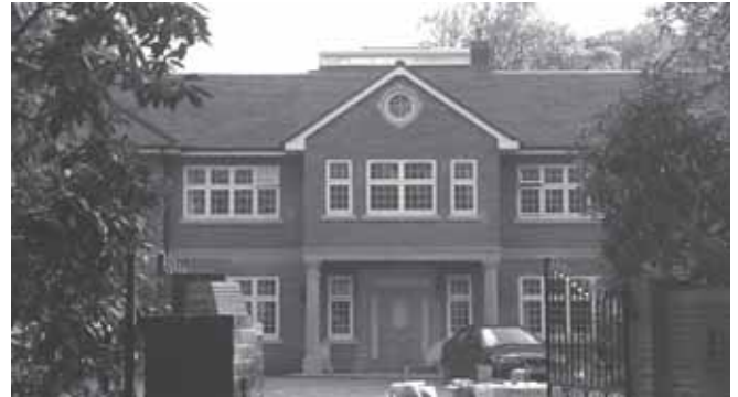
House in Straight Mile

After the restrictions on building and control of building materials were lifted in the 1950s, a number of houses were built across the area. These included the large houses along Straight Mile, the most recent of which is only a few years old and features an atrium. These houses are all individual and have wings and extensions giving a variety of footprints.