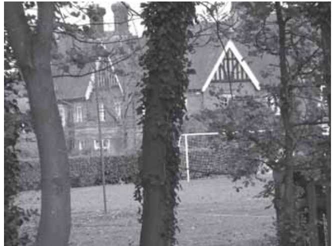
Highwood House now Stroud School

There is no prevailing building form in Crampmoor and Highwood. The various houses reflect the fashions and aspirations of their owners. There were few houses here in 1800.