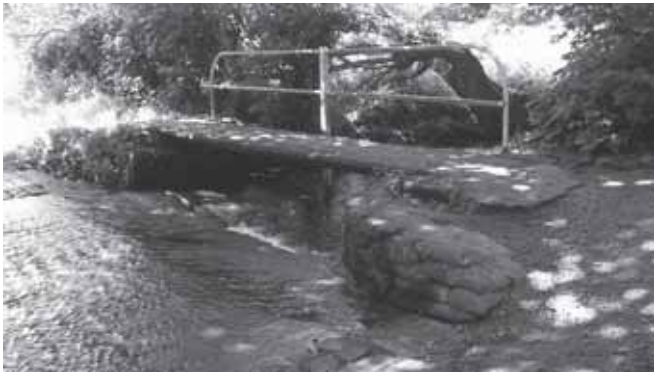
Ford of Tadburn Lake in Crampmoor Lane

Crampmoor and Highwood are small settlements on the eastern extremity of Romsey. Most of the settlement is on the slopes of the valley created by the small stream that has kept its Saxon name of Tadburn Lake. It rises in nearby woods and marshy land and is a tributary of the River Test. In addition a few houses have been built on the plateaux on either side of the valley.