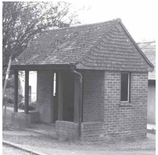
Bus shelter at Crampmoor

There are no street lights in this area apart from the rear of St Swithun's church, and opinion is divided about whether any would be desirable.