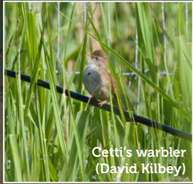
Cetti's warbler (David Kilbey)