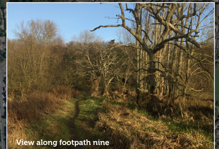
View along footpath nine