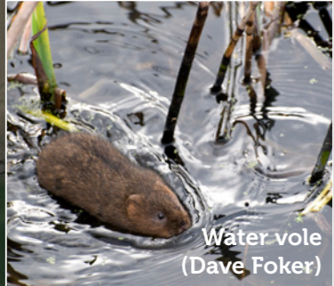
Water vole (Dave Foker)