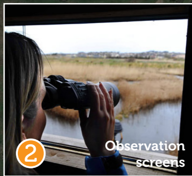
2 Observation screens