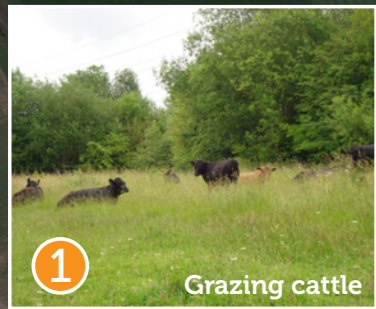
1 Grazing cattle