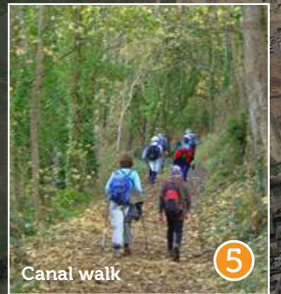
5 Canal walk