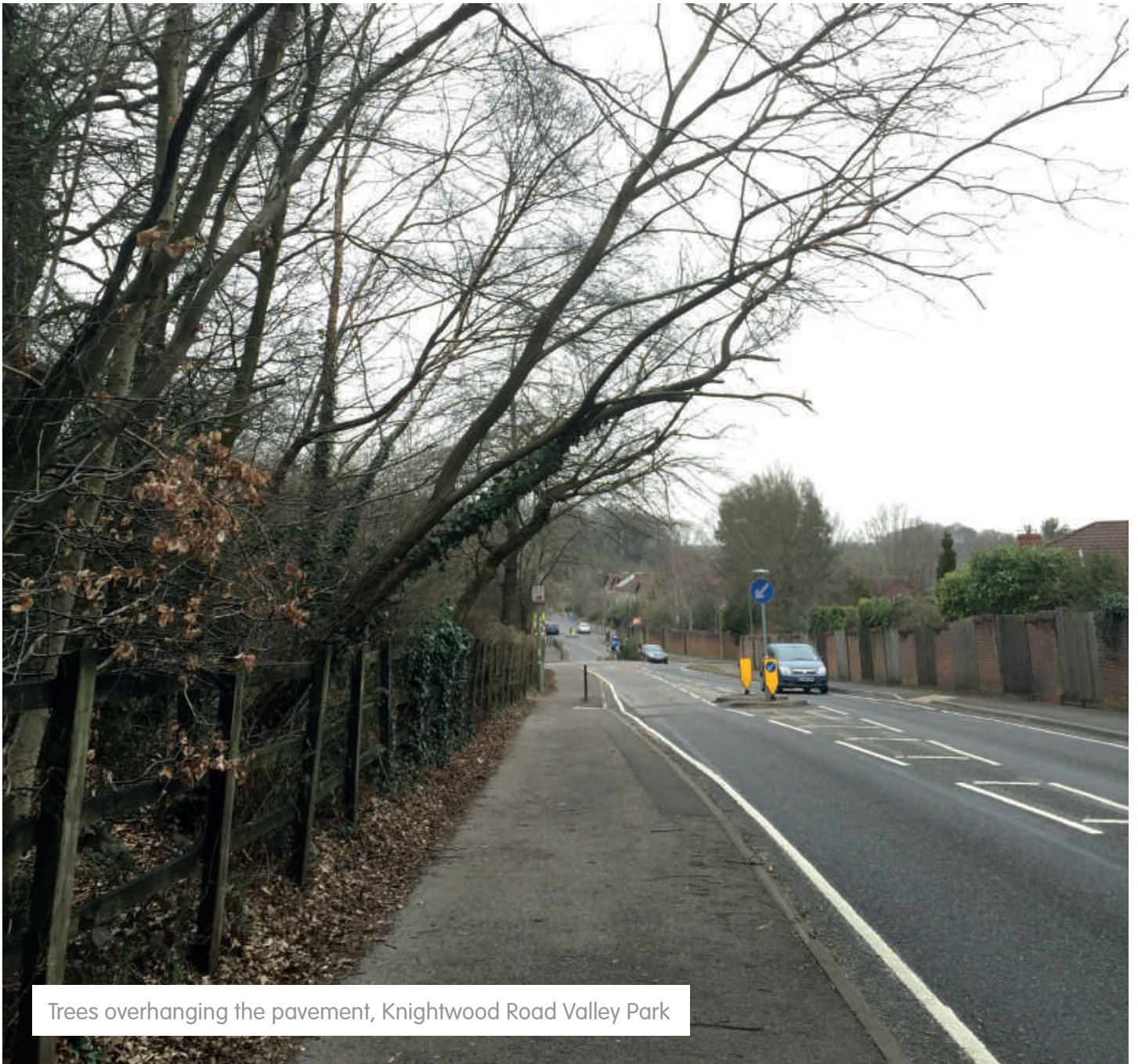
Trees overhanging the pavement, Knightwood Road Valley Park

Provided that only the minimum amount of pruning is being carried out to comply with the requirements of the Highway Act 1980, in other words the pruning is directly required to maintain adequate clearance over a footpath or road, then a formal application (for trees that are subject to a tree preservation order) or a 'Notice of Intent' (for trees that are growing in a conservation area) is not required. This exemption applies irrespective of whether the highway authority has served notice on you to carry out the clearance work. The pruning should be carried out to currently acceptable arboricultural standards.