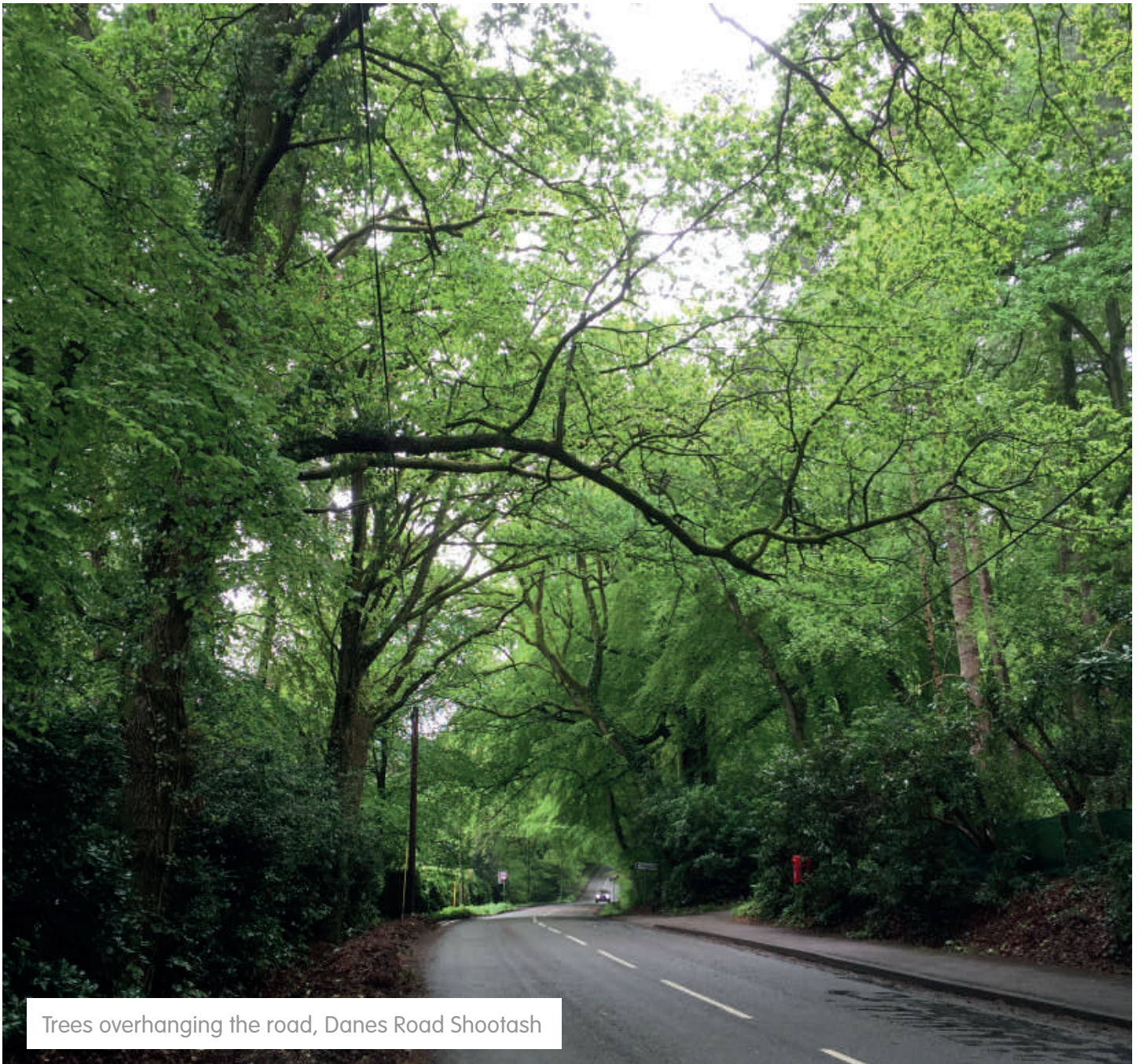
Trees overhanging the road, Danes Road Shootash