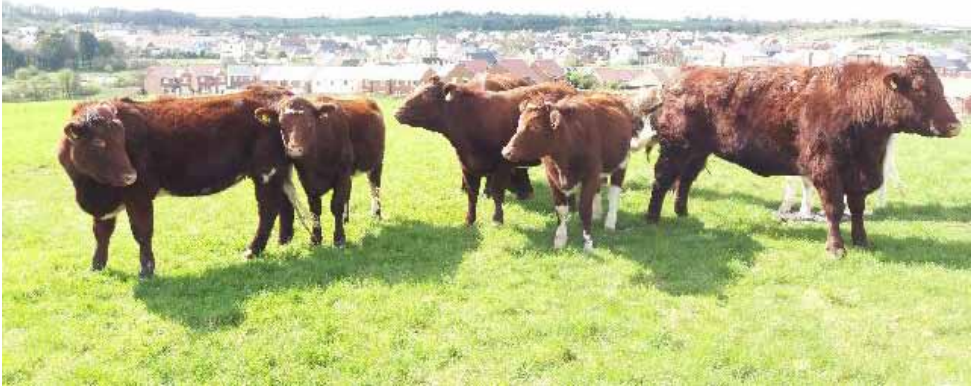
Beef shorthorn cattle grazing on Harewood Common

Harewood Common is being managed through cattle grazing. Grazing for conservation provides a sensitive alternative to mowing, with cattle stocked at low densities, which will graze the grass at varying heights to allow wildflowers to flourish. Grazing will take place between April and October, with the fields remaining open to the public throughout. During this time dog walkers will be asked to keep their dogs under close control and on a lead around livestock to prevent any disturbance