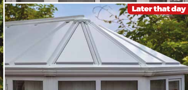
Later that day

Your conservatory that was too cold to eat breakfast in, could be nice and toasty by teatime